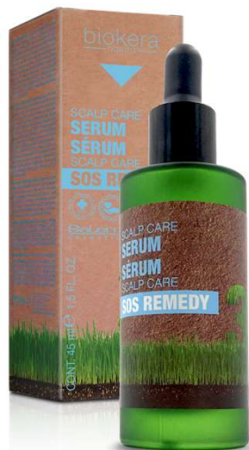
Serum Art.3044 (45ml)