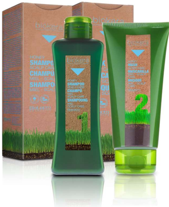
Shampoo Art.3042 (300ml) and 3045 (1000ml)